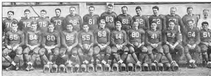
1938 Cincinnati Bengals

The Bengals began play in the AFL in 1968. The AFL merged with the NFL in 1970, and the Bengals have been members ever since.