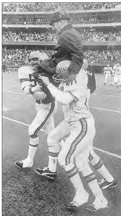
Bengals coach Paul Brown is carried off the field on Dec. 20, 1970, following a 42-7 win over the Boston Patriots at Riverfront Stadium. The win clinched a playoff berth for the three-year-old Cincinnati franchise. At the time, no other team had reached the playoffs so early in its history.